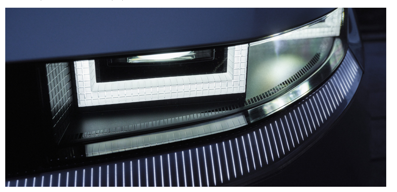
Distinctive LED headlamps with 256 Parametric Pixels.

<sup>1</sup>72.6kWh battery variant WLTP. Actual results may vary.