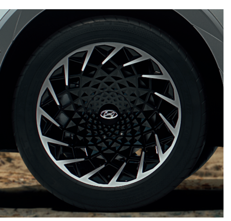
Aerodynamic 20" diamond cut alloy wheels - Ultimate trim.

The IONIQ 5's pure design is a refreshing take on electric vehicles, stripping away complexity to celebrate clean lines and minimalistic structures. The unique clamshell bonnet spans the entire width of the car, minimizing panel gaps for a clean, high-tech look. The LED lighting showcases its signature 256 Parametric Pixels – jewel-like design elements that will feature on the exterior of all future IONIQ models.