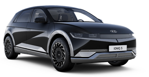
Phantom Black Pearl