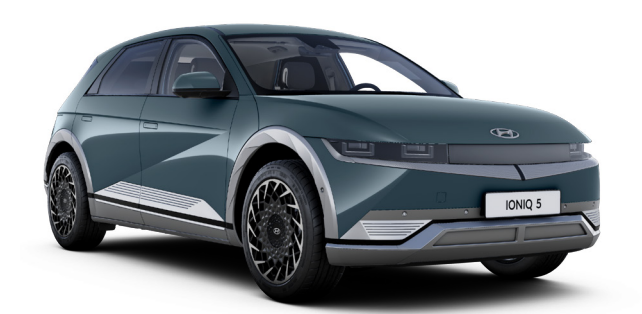
Digital Teal-Green Pearl