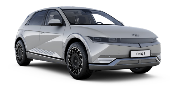
Cyber Grey Metallic