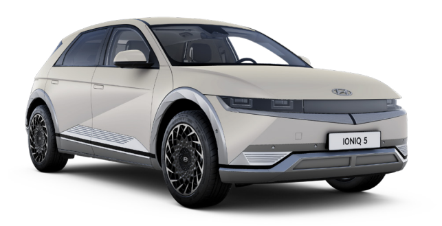
Gravity Gold Matte