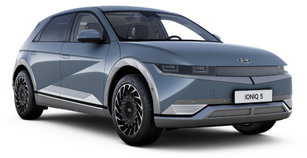
Lucid Blue Pearl