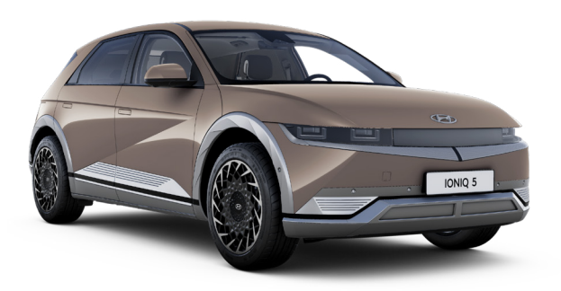
Mystic Olive-Green Pearl