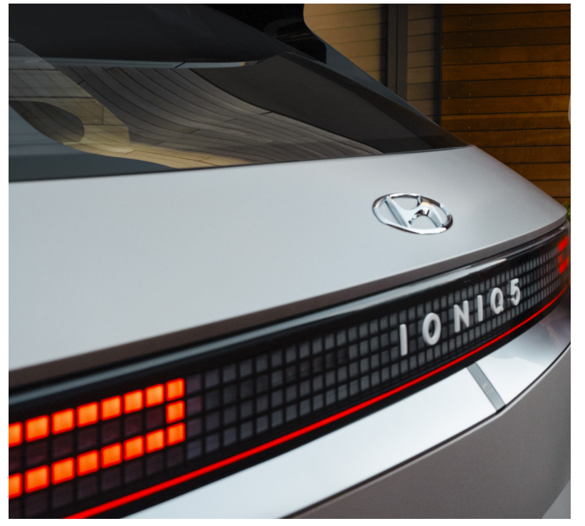
Signature Parametric Pixel rear light design.