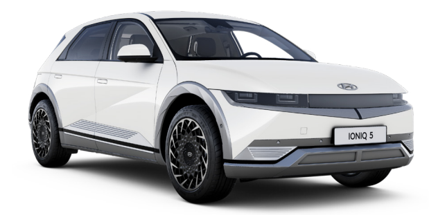
Atlas White Solid

Paint finishes to complement the overall uniqueness of the IONIQ 5.