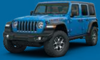
Hydro Blue Pearl