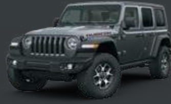
Granite Crystal Metallic