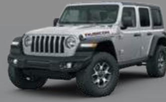
Billet Silver Metallic