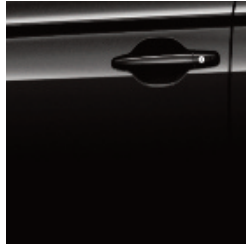
AMETHYST BLACK (P)