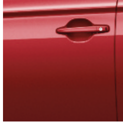
RED DIAMOND (D)