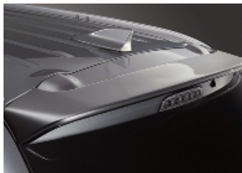
Large Rear Spoiler