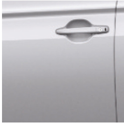
FROST WHITE (S)