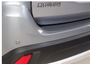
Rear parking sensors