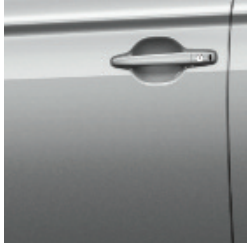
STERLING SILVER (M)