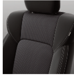
BLACK FABRIC (DESIGN)