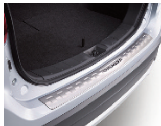
Rear bumper protector