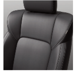
BLACK LEATHER (EXCEED)