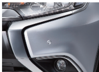
Front parking sensors

All accessories enjoy a 3-year 62,500-mile warranty if fitted at the time of purchase. For details of the complete range visit www.mitsubishi-motors.co.uk/accessories