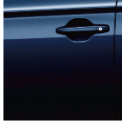
TANZANITE BLUE (P)