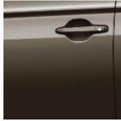
GRANITE BROWN (M)