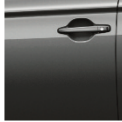
ATLANTIC GREY (M)