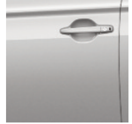
WHITE PEARL (P)