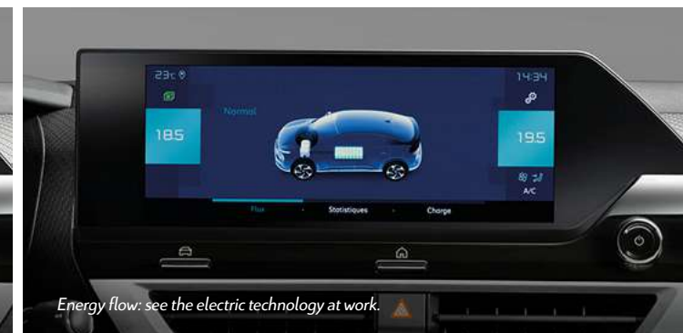
Energy flow: see the electric technology at work.