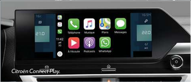
Citroën Connect Play.

With its sleek and modern dashboard, its door trim pads with soft lines and its high and wide centre console, the passenger compartment of New Citroën ë-C4 – 100% electric and Citroën C4 inspires well-being and peace of mind at first sight. The Head-Up Display* helps the driver to remain focused on the road while viewing essential driving information. In the centre of the dashboard, the 10" high-definition touch screen groups together all of the car's controls. New Citroën ë-C4 – 100% electric and Citroën C4 are fitted with 20 driving assistance technologies and six connectivity systems. Among these, Citroën Connect Nav*, a latest-