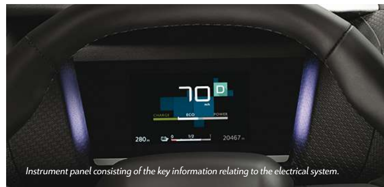
Instrument panel consisting of the key information relating to the electrical system.

of the dashboard display the energy flow and the programming screen for the deferred charging of the battery. When the car is charging, the screen displays the information relating to the charge: remaining charging time, range recovered and charging rate.