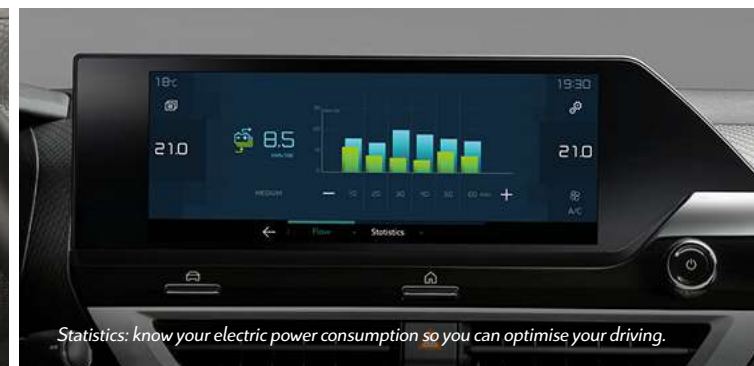
Statistics: know your electric power consumption so you can optimise your driving.