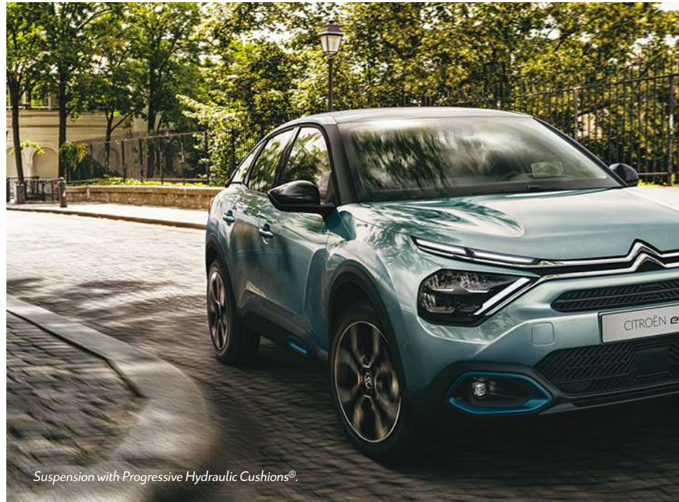
Suspension with Progressive Hydraulic Cushions®.