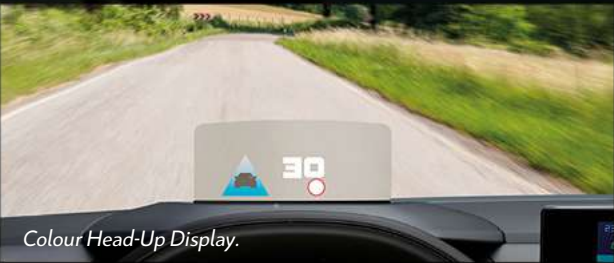
Colour Head-Up Display.

The Highway Driver Assist semi-autonomous driving system combines the adaptive cruise control with Stop & Go function with a system that keeps the vehicle in its lane. The driver then no longer needs to manage the speed or the trajectory, as these functions are controlled by the car.