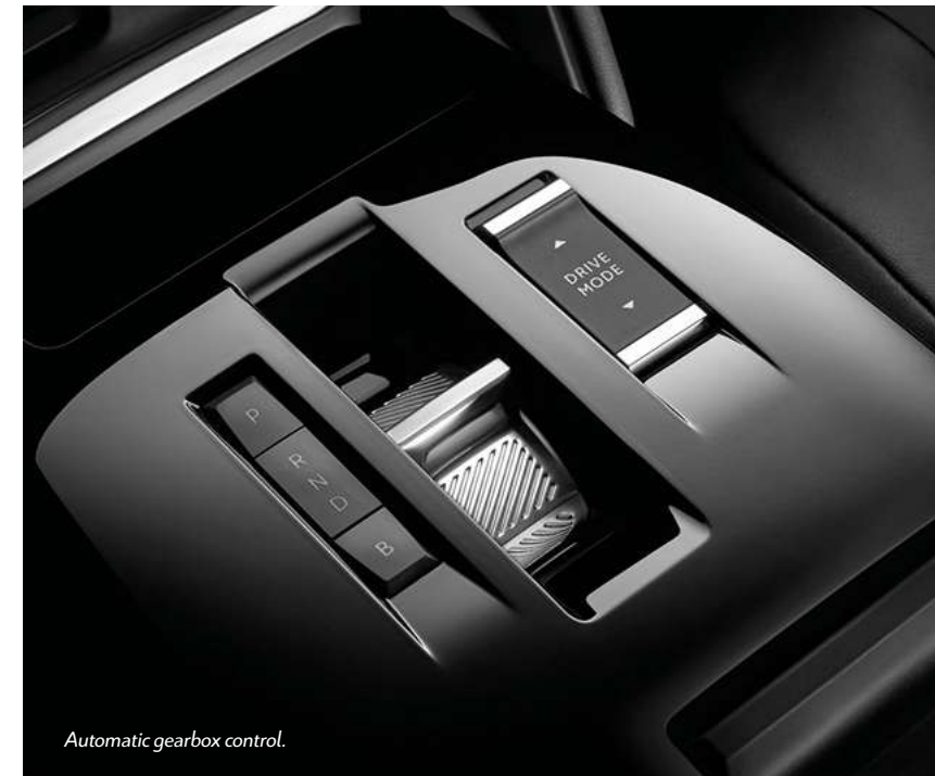
Automatic gearbox control.