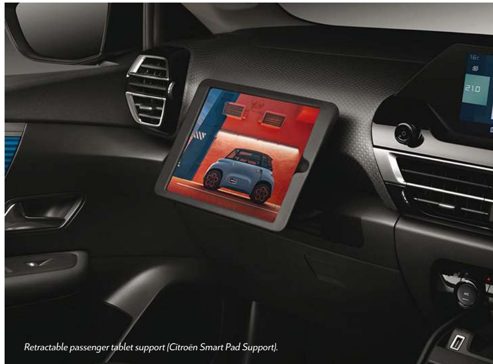
Retractable passenger tablet support (Citroën Smart Pad Support).