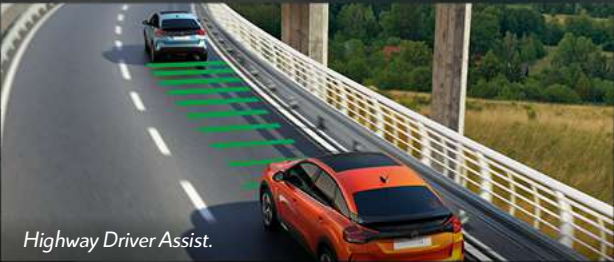
Highway Driver Assist.

The Highway Driver Assist semi-autonomous driving system combines the adaptive cruise control with Stop & Go function with a system that keeps the vehicle in its lane. The driver then no longer needs to manage the speed or the trajectory, as these functions are controlled by the car.