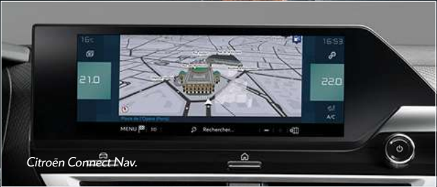
Citroën Connect Nav.