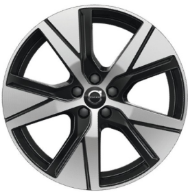
19" 5 Spoke (std Recharge Plus)