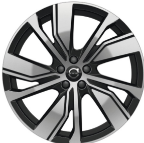
20" 5 Double Spoke (#1133)