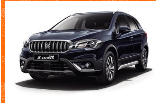
Sphere Blue Pearl Metallic