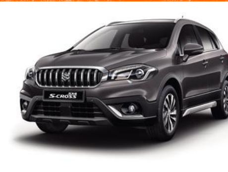
Mineral Grey Metallic