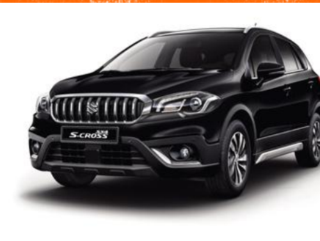
Cosmic Black Pearl Metallic