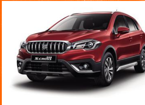
Energetic Red Pearl Metallic