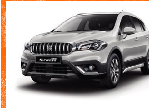
Silky Silver Metallic