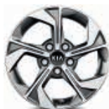
16" Alloy Wheels 205/60R16