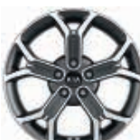
18" Alloy Wheels 235/45R18