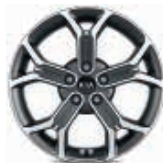
18" Alloy Wheels 235/45R18