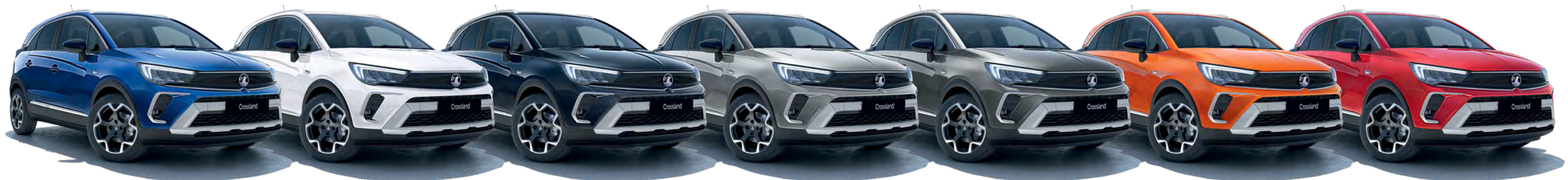
Navy Blue Two-coat metallic*